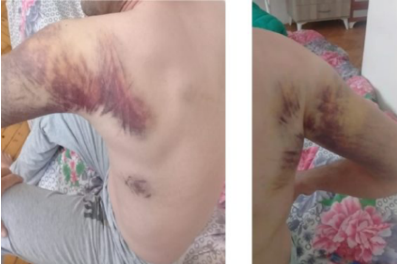
Border Violence Monitoring Network. (April 27, 2020). Lavara, Evros. Retrieved from https://www.borderviolence.eu/violence-reports/april-27-2020-2130-lavara-evros/

BVMN identified the use of excessive and disproportionate force by the Greek police in almost 90% of testimonies.