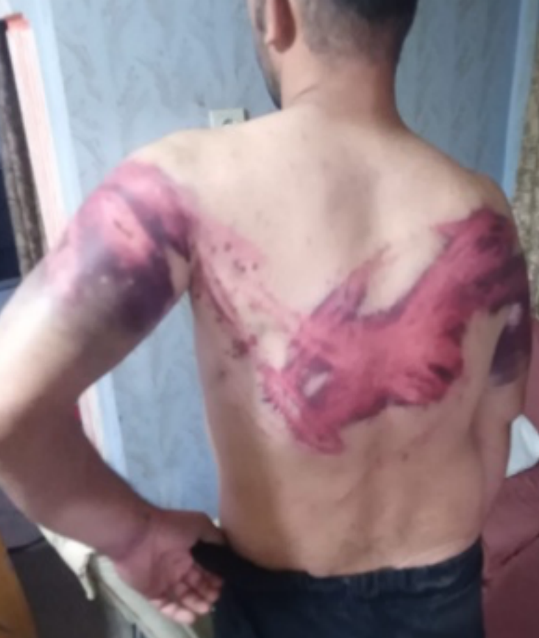
Border Violence Monitoring Network. (June 21, 2020). Ipsala, Edirne, Turkey. Retrieved from https://www.borderviolence.eu/violence-reports/june-21-2020-2100-ipsala-edirne-turkey/

The testimony of a 21 year old male respondent, who was apprehended in the village of Orestiada near the Turkish border, on 30 July, 2020, explains the difficult conditions which do not respect human rights they had to face when arrested. They were not given food and water, had water thrown to their faces, put in a room with women and children, had their clothes taken off and not addressed in a language they understood. In addition to these conditions deteriorating their dignity, officers were using violence and beating them whenever they wanted to ask for asylum. The respondent was beaten so badly with metal batons that he could barely walk the next day and still had bruises one month after the event. They were threatened with the words : "If you come back to Greece, we will kill you." When officers brought them back at the border, they continued