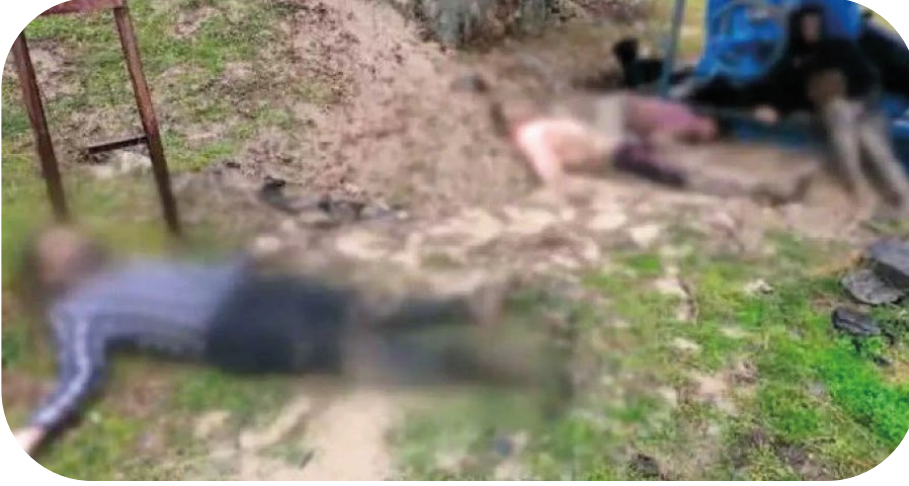
Photo: Frozen bodies, found by the Turkish villagers in the Greek Border, Feb. 2, 2022.

The following information was obtained from the unofficial statements of the İpsala District Gendarmerie Command, District Police Department and the prosecutor's office: