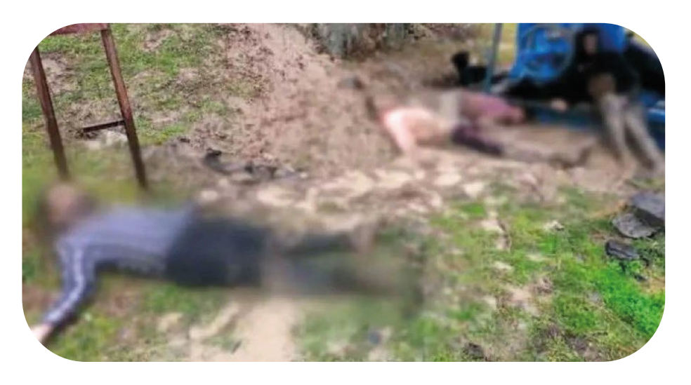
Photo: Frozen bodies, found by the Turkish villagers in the Greek Border, Feb. 2, 2022.

The following information was obtained from the unofficial statements of the İpsala District Gendarmerie Command, District Police Department and the prosecutor's office: